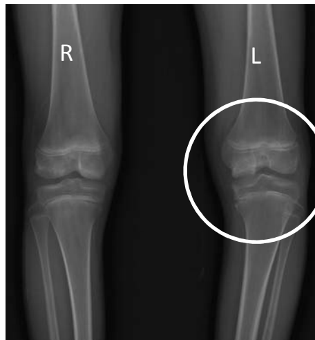
After 6 Treatments